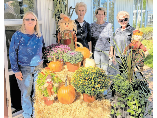
The Plants and Grounds Committee took a trip to Atlantic Nursery to purchase fall plants with the generous gift certificate received from Rockville Centre Boy Scout Troop #40.